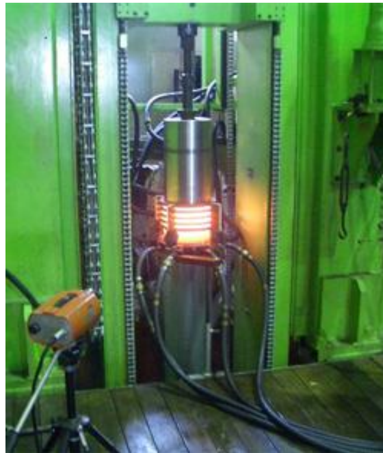
High-frequency quenching of large

We can offer the best specifications about hardness, hardened depth of roll depending upon materials and customers application condition, please feel to contact us.