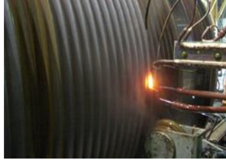
Dual quenching of groove and top