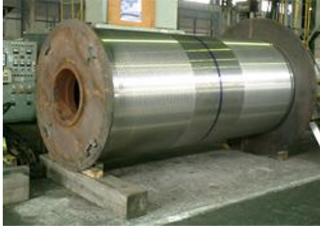
Wind-up drum for

DHF has been supplying steel-wire wind-up drums hardened by IH quenching for many years employing the original IH technology based upon a long accumulated know-how and s DHF's IH quenching service to the drums can meet customer's requirements in the most suitable based upon its application condition. DHF also can supply the drums on the turn- key basis, meaning from procurement of raw material, fabricating, to quenching.