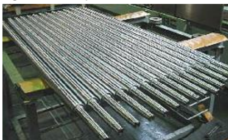
Long leveler roll regeneration

DHF can also provide suggestions how to improve the performance of the rolls based upon diagnosis and operation conditions of them.