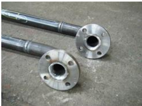
Prefabricated pipes, ready for