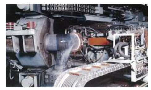
30-type bending machine